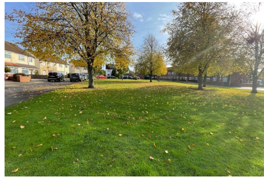
Spacious Four/Five Bedroom Semi-Detached House – Popular Residential Location

A spacious four/five bedroom semi-detached house situated in a popular residential area, overlooking green belt land to the front. This excellent family home is conveniently located close to local amenities and schools.