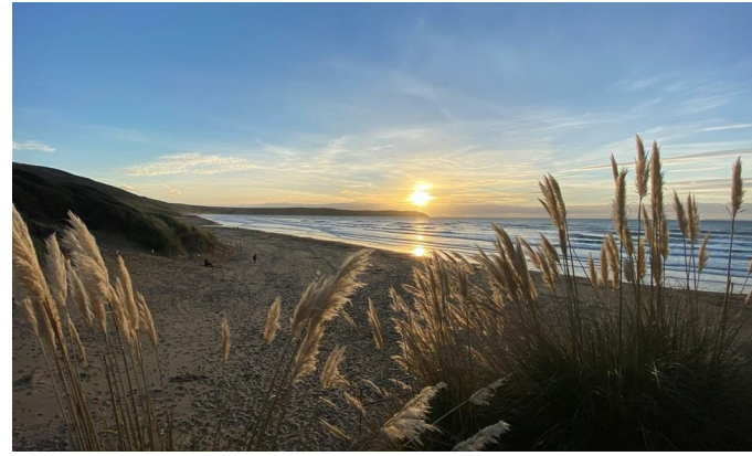
Saunton Sands, Woolacombe Beach & Croyde Bay