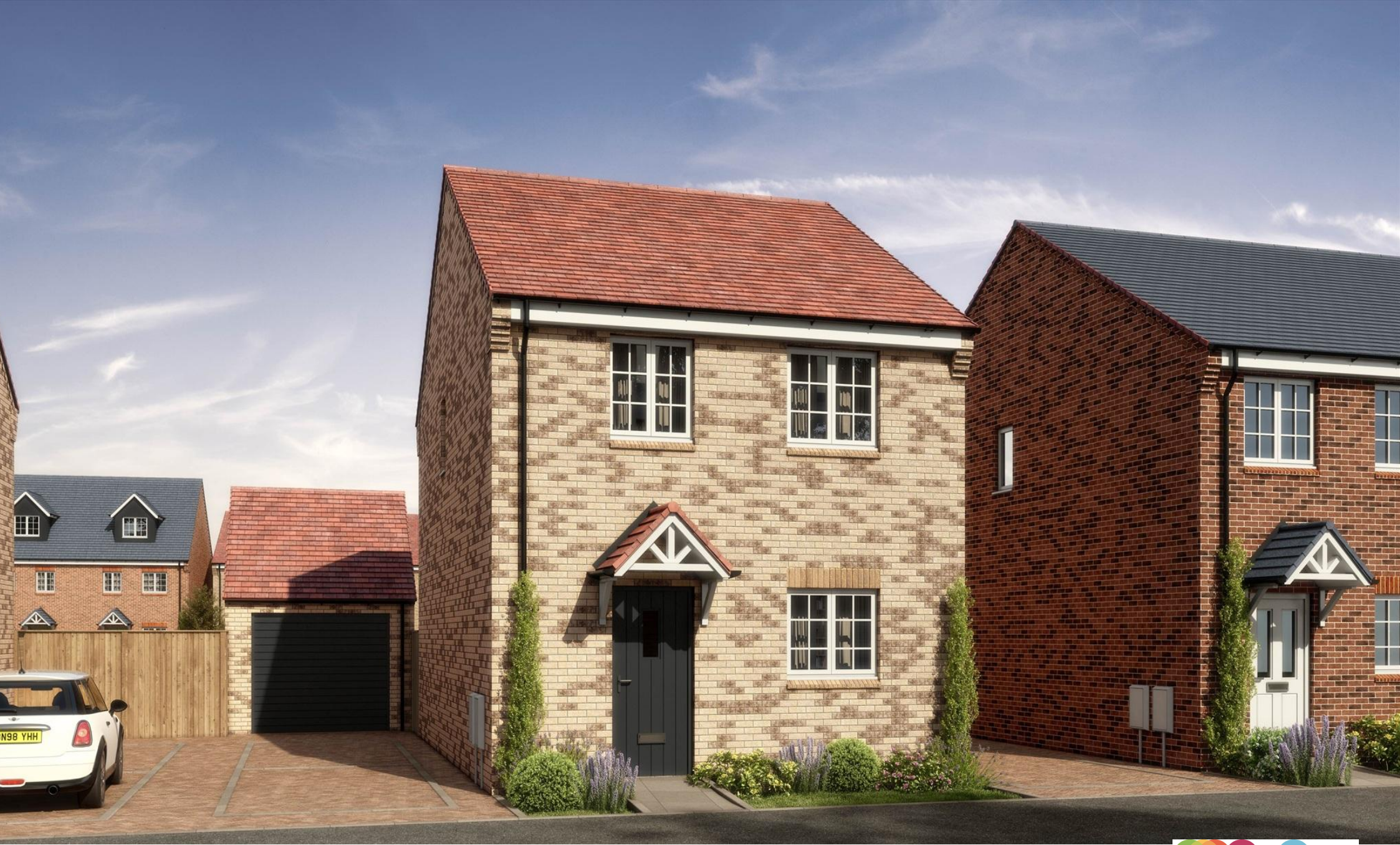
The Goldcrest Barrowby Place, Grantham NG31 8XT