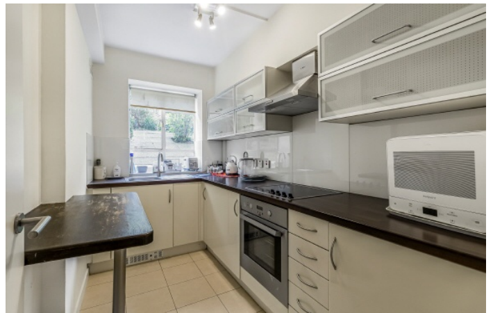
Beaumont Street, W1G