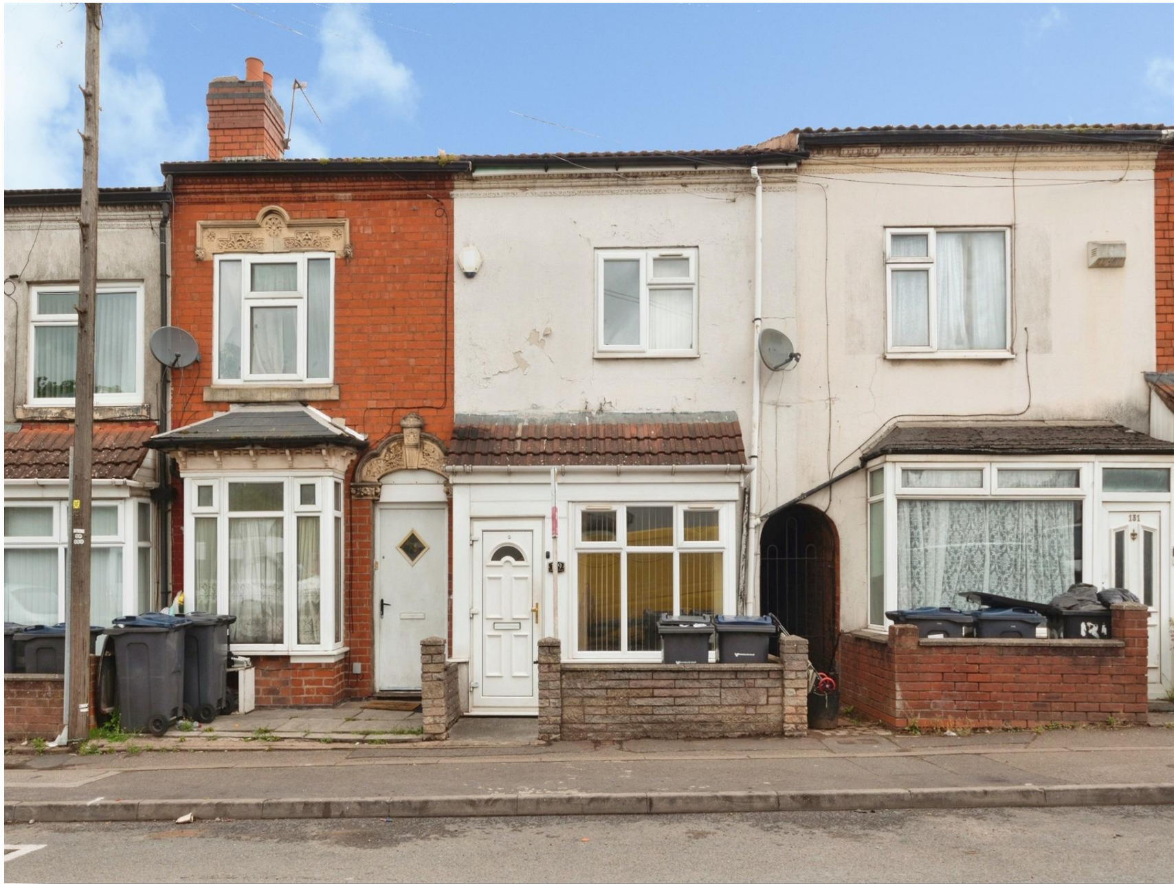
Formans Road, Sparkhill Birmingham B11 3AX