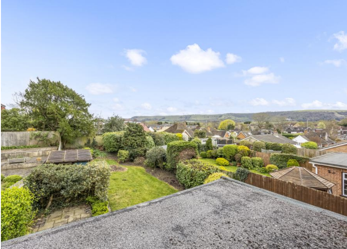
Stunning views of The South Downs from the first floor.