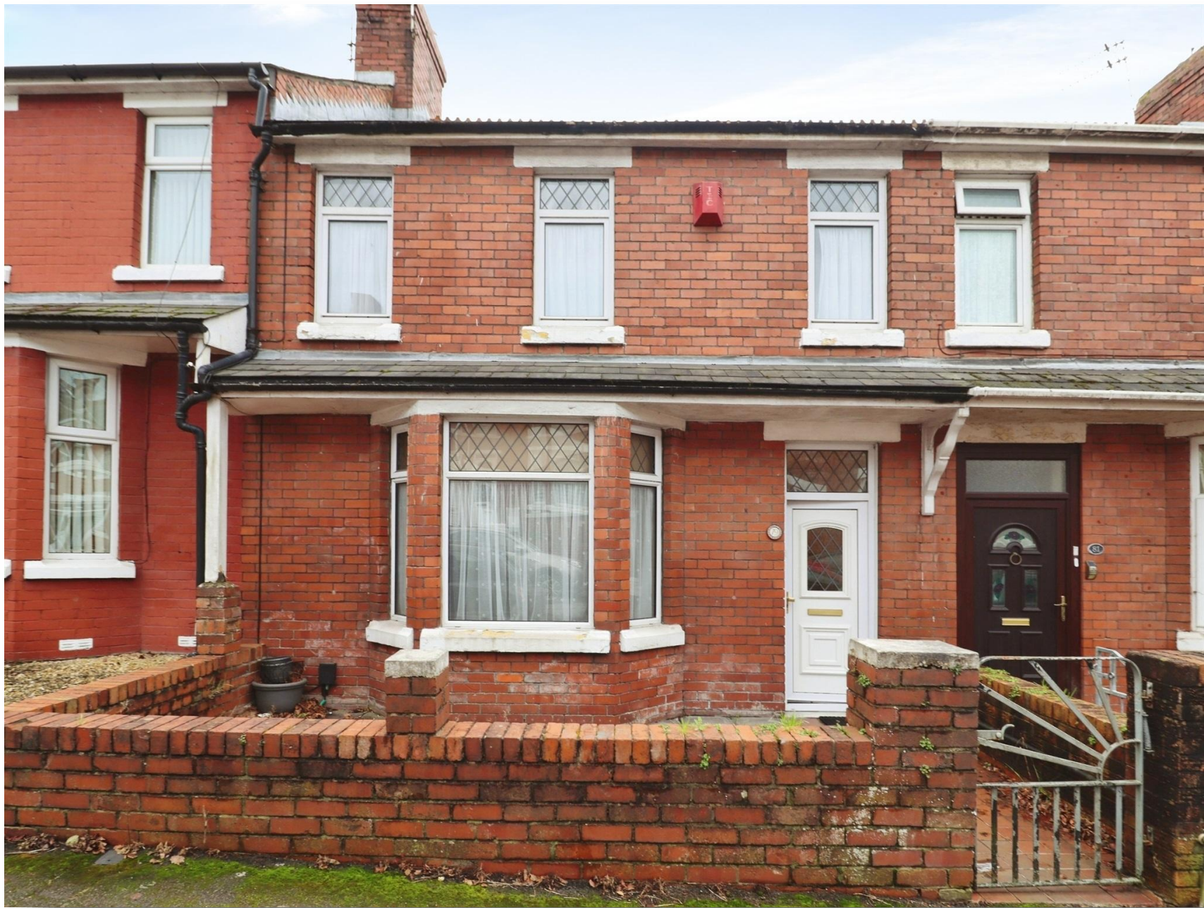
Woodlands Road, Barry CF63 4EG