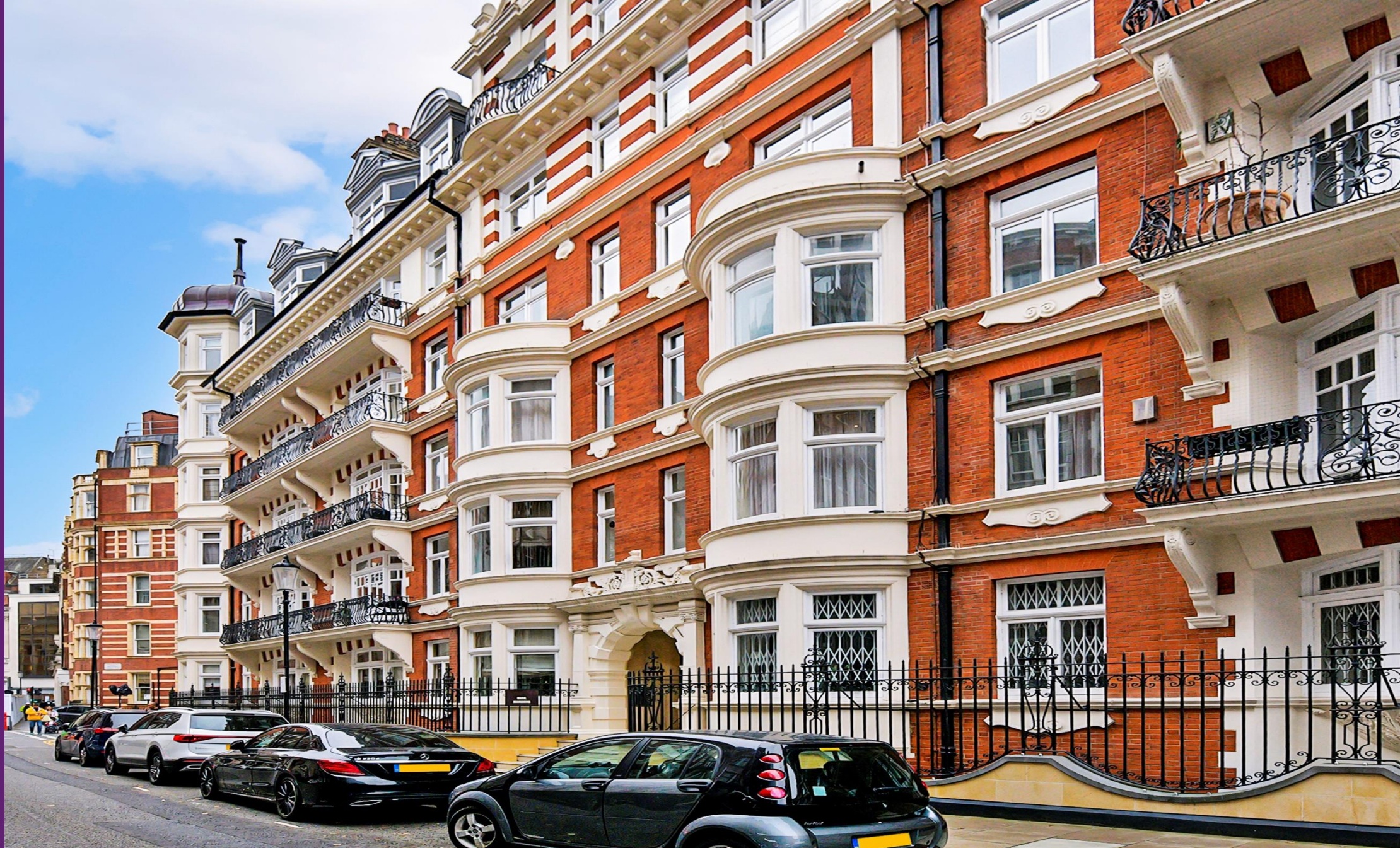
Basil Mansions Basil Street, SW3