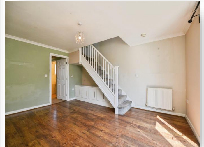
Faraday Drive, Stockton-On-Tees TS19 8NY