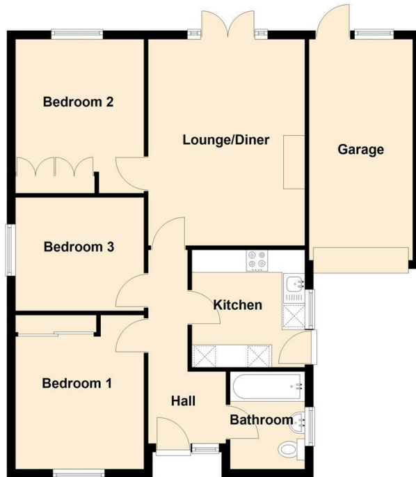
Total area: approx. 80.0 sq. metres (861.4 sq. feet)