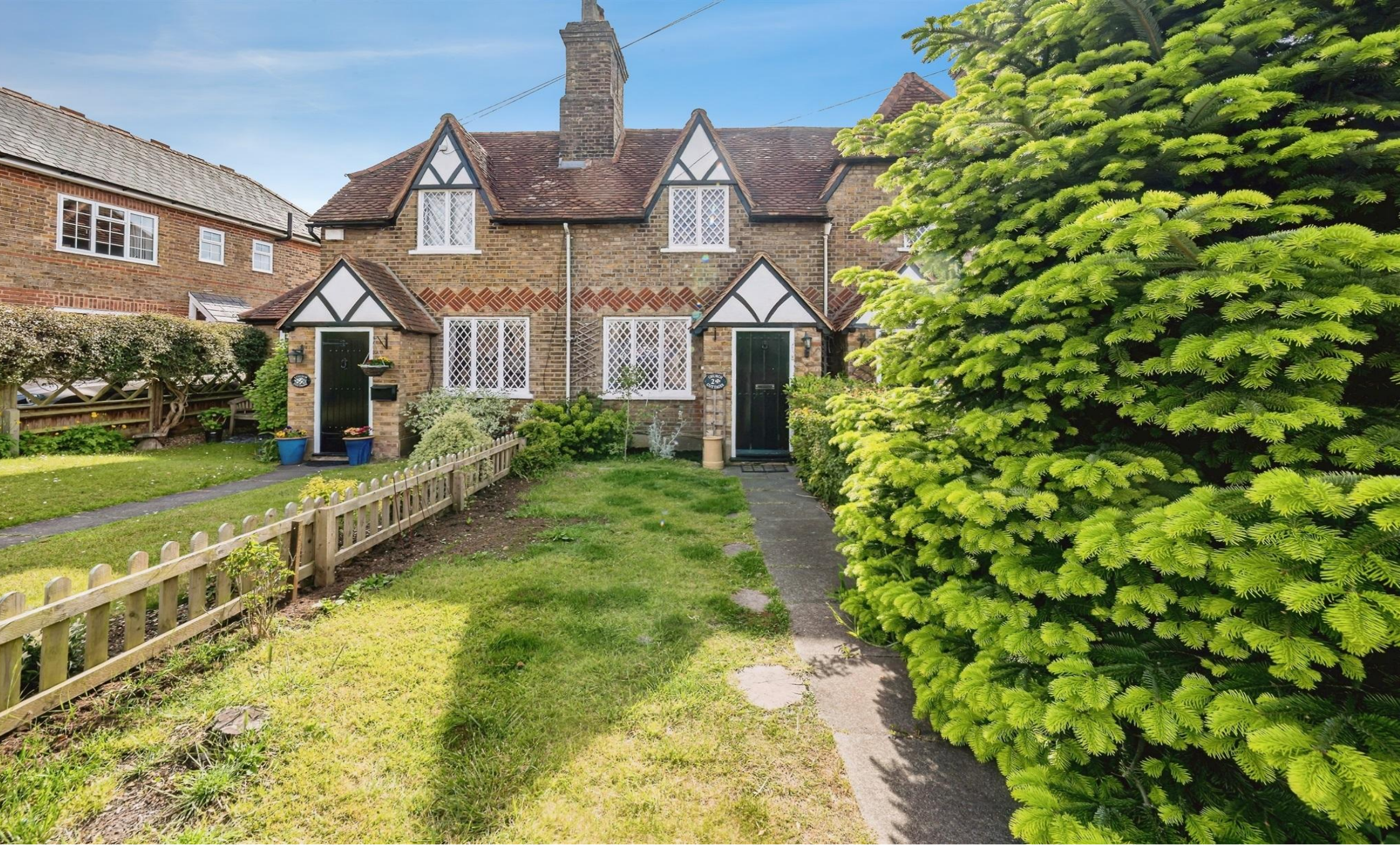
Church Cottages Hill Farm Road, Taplow Maidenhead SL6 0HE