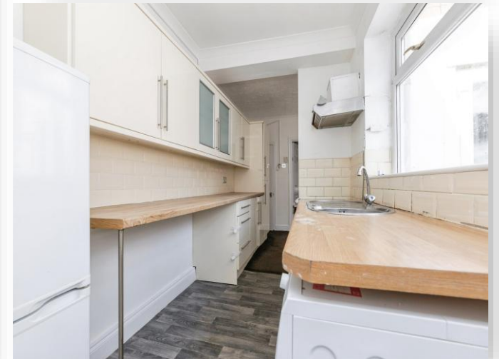
Bright Street, Hartlepool TS26 8JY