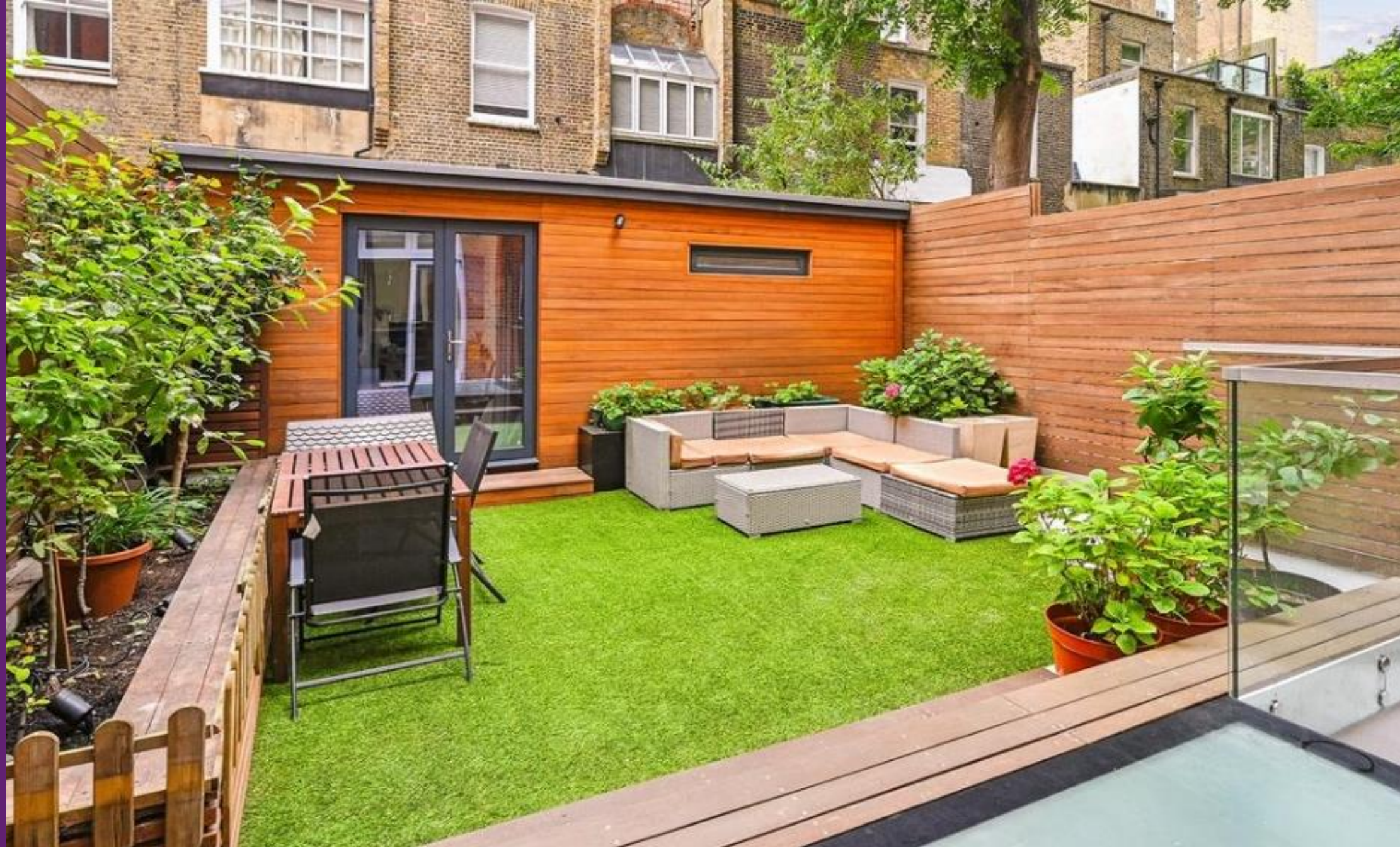
Barkston Gardens Earls Court, SW5