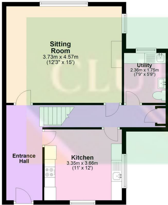
Ground Floor Approx. 49.0 sq. metres (527.0 sq. feet)