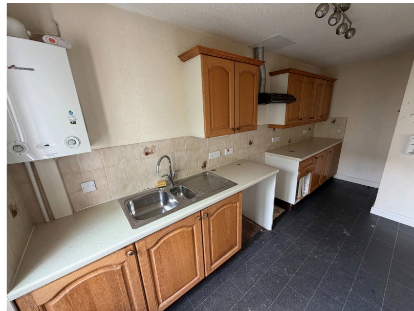
5 Grosvenor Court

OF INTEREST TO CASH BUYERS ONLY A 1 bedroomed Ground Floor floor purpose built Flat in need of renovation and upgrading which is ideally situated in a level location for access to Paignton Town Centre and the Seafront. It offers spacious accommodation comprising living room, kitchen, double bedroom (with fitted wardrobe), a wet room and hallway. Benefits include double glazing and gas central heating. There is an entrance lobby and access to the building is via a secure intercom system. Outside there are beautifully maintained communal garden areas plus an allocated parking space and ample communal visitor parking. Viewing is recommended to fully appreciate the property which will be sold with No Onwards Chain.