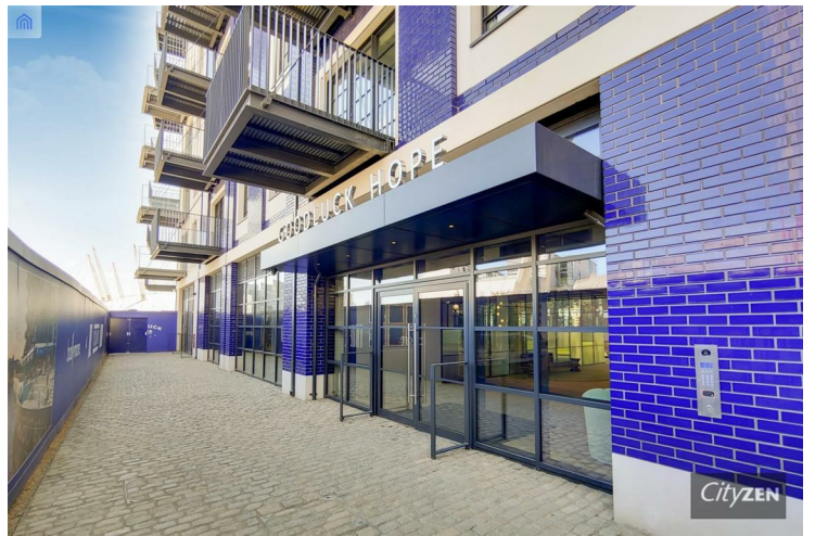
GOOD LUCK HOPE