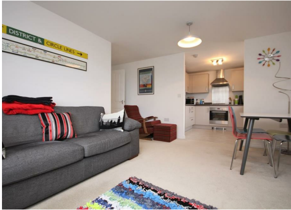
Top Floor 588 sq.ft. (54.6 sq.m.) approx.