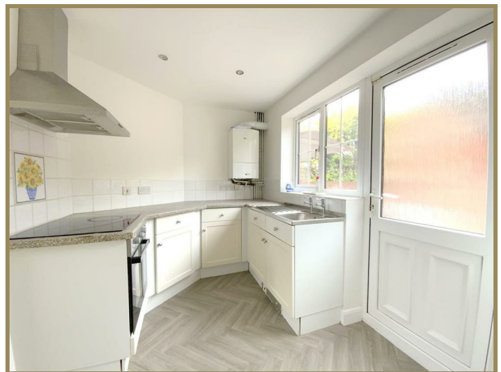
1 Fern Mews Market Place, Tetney, DN36 5NN £142,500