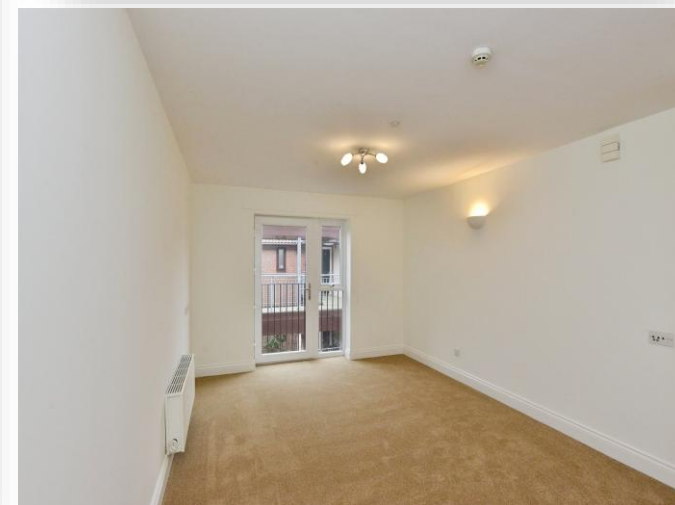
The Limes, Westbury Lane, Newport Pagnell, MK16 8FA