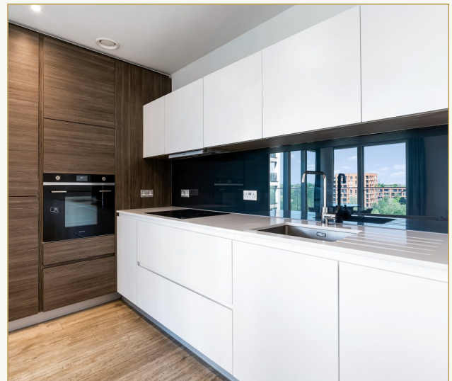
Kitchen with integrated appliances