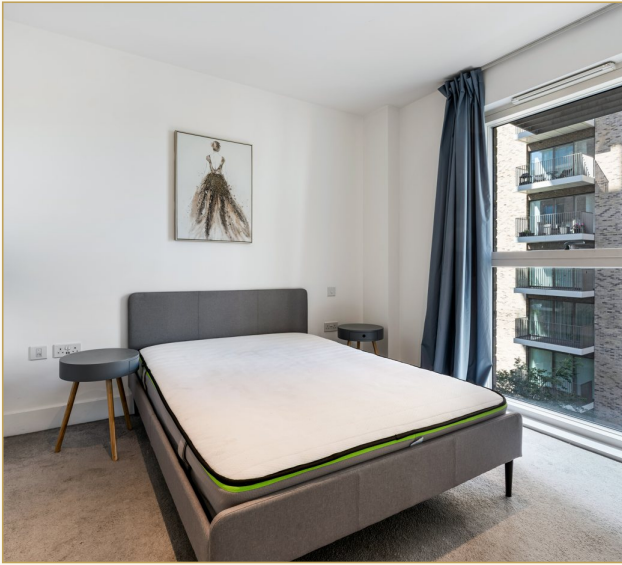
Principal bedroom with fitted wardrobes

A selection of interior views from across the apartment.