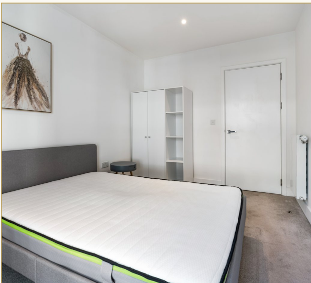
Fitted bedroom storage