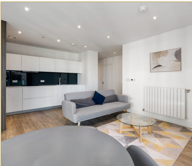
Open-plan living, dining and kitchen

A full range of integrated appliances, sleek handleless cabinetry and stone worktops feature in the kitchen, while engineered wood flooring runs through the living area. Both double bedrooms are well-proportioned and benefit from fitted storage, complemented by a contemporary bathroom and a separate utility room.