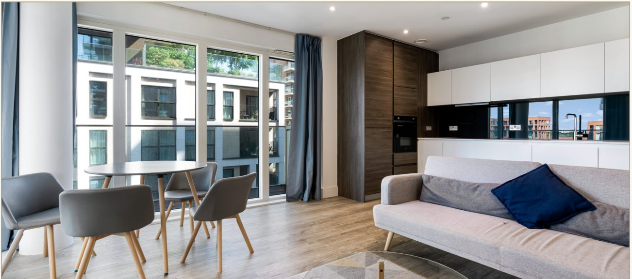
Living area with sliding doors to the private balcony