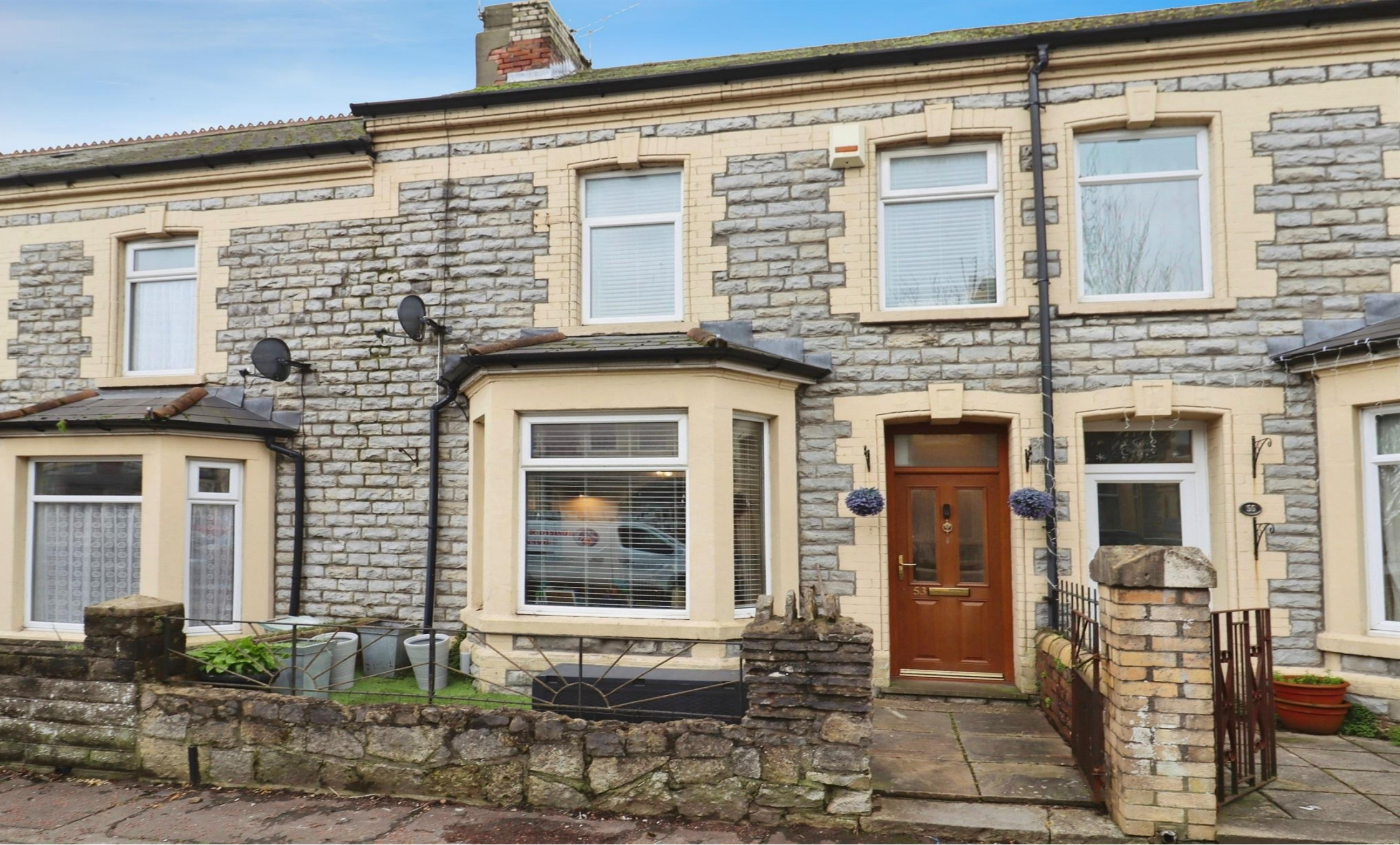
Station Street, Barry CF63 4LW