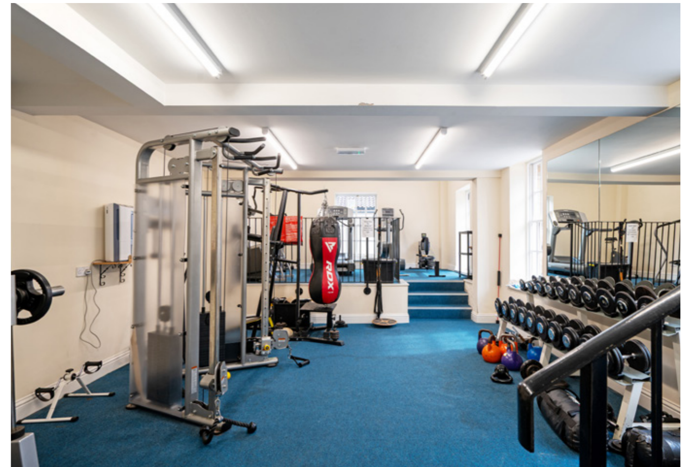
COMMUNAL GROUNDS, TENNIS COURT & GYMNASIUM