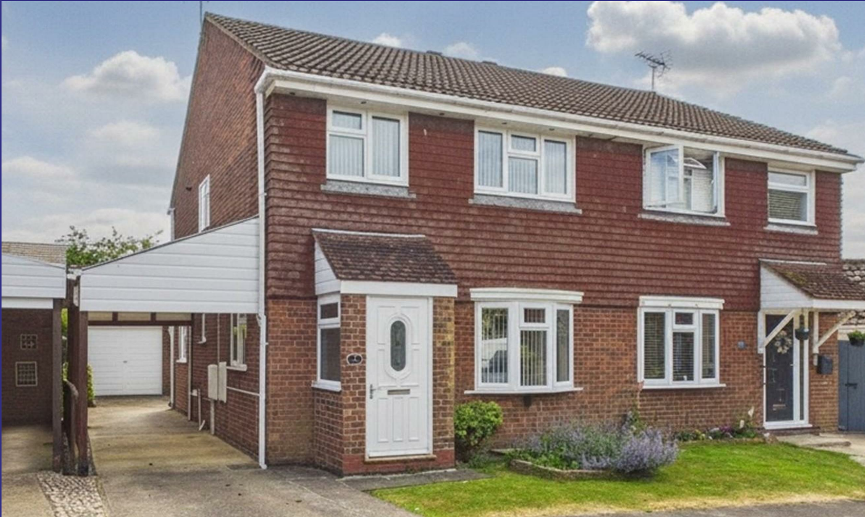
Shepherd Drive Ashford