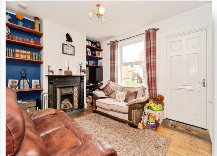
Briston Road, Melton Constable, NR24 2DF