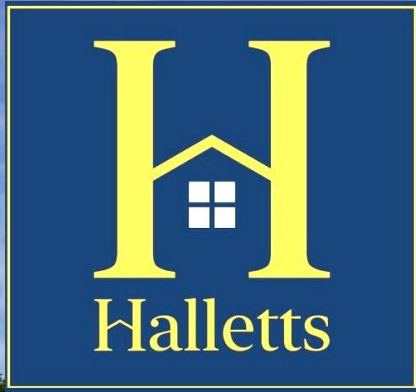
4 Sandstone Grove, Hermitage, Berkshire RG18 9WS