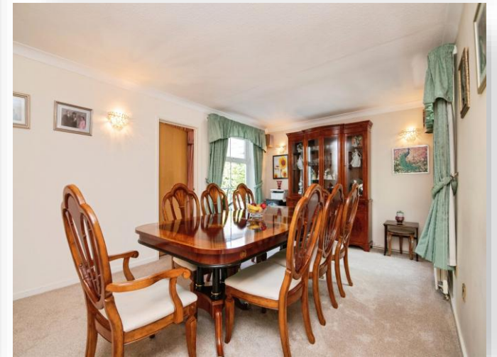
Carpenter Road, Birmingham B15 2JH