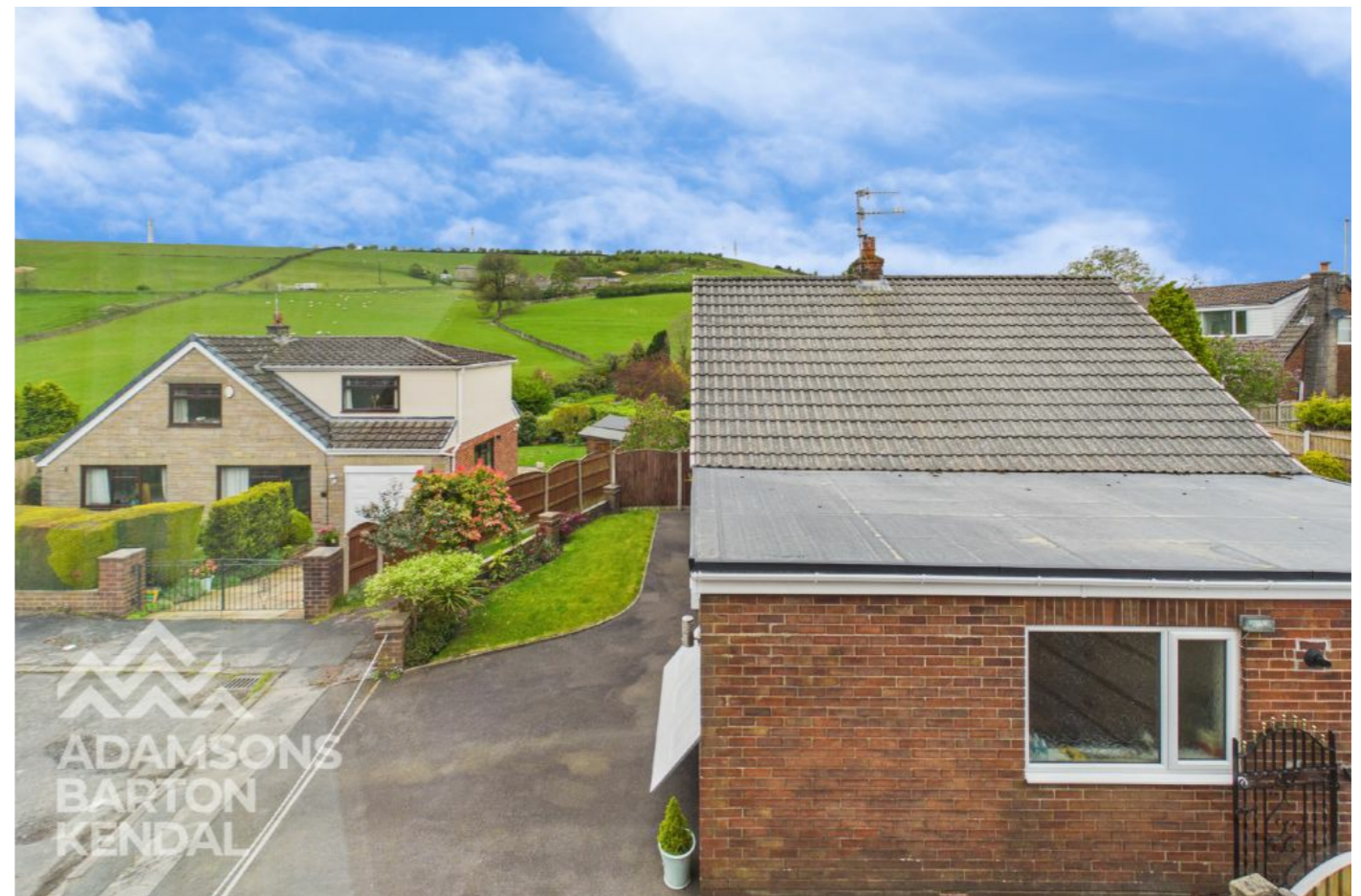
The Greens, Whitworth OL12 8AQ