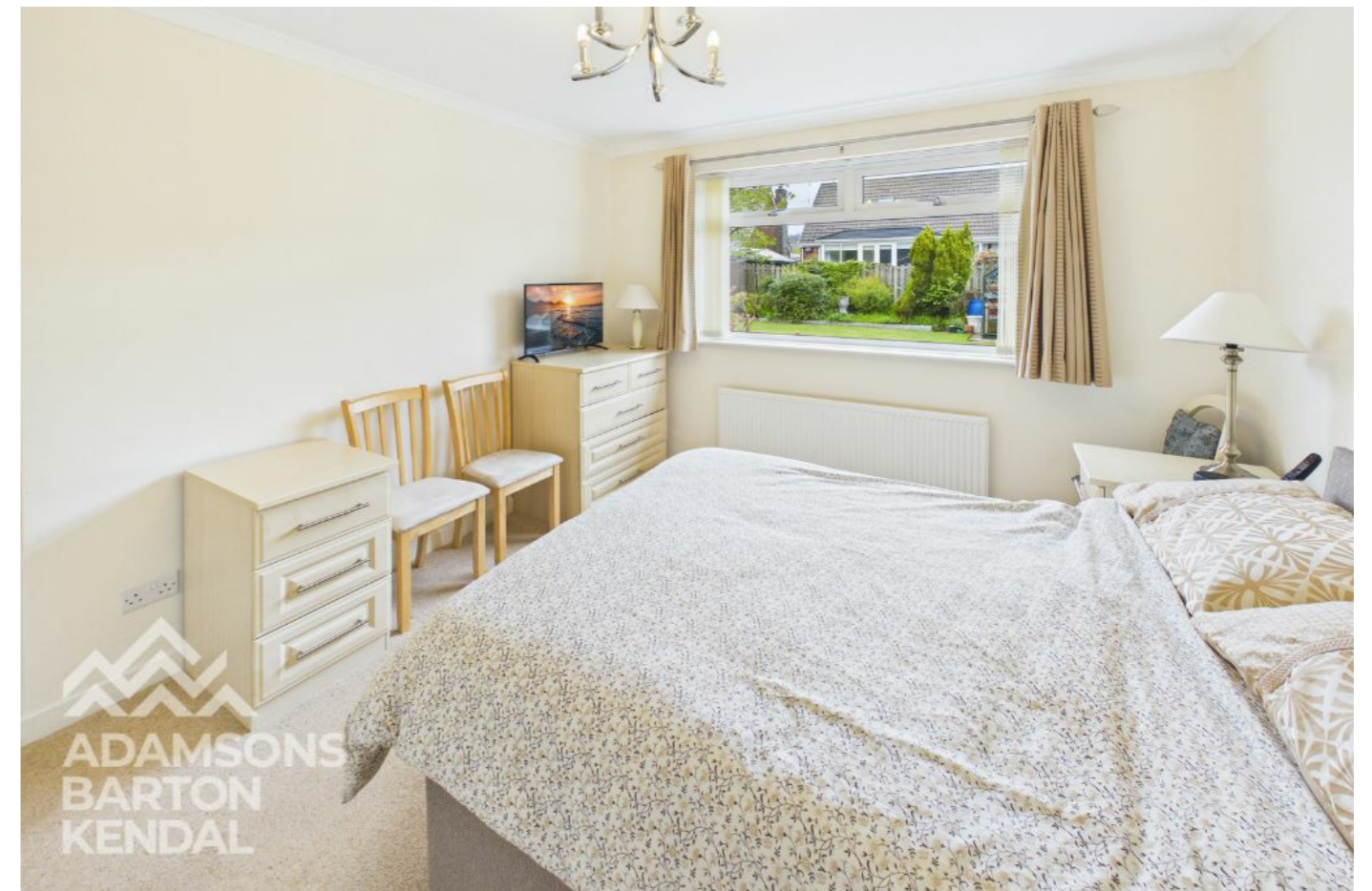
The Greens, Whitworth OL12 8AQ