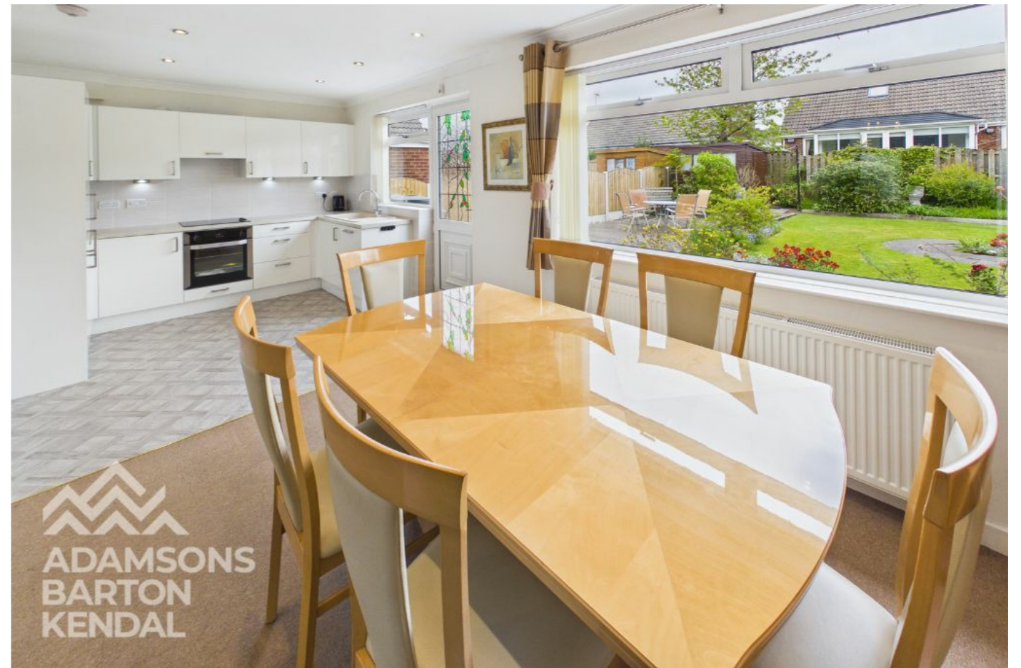
The Greens, Whitworth OL12 8AQ