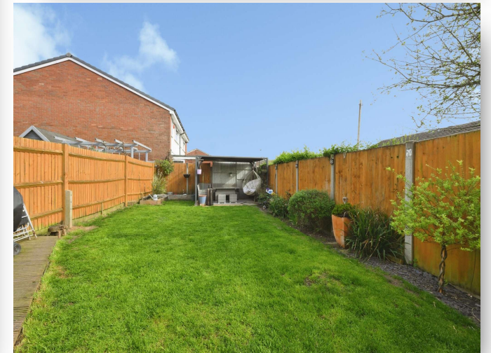
The Cedars, Broxbourne EN10 6FX