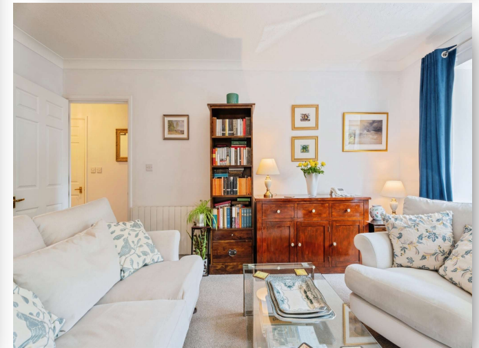
Old School Court, Violet Hill Road, Stowmarket, IP14 1NB