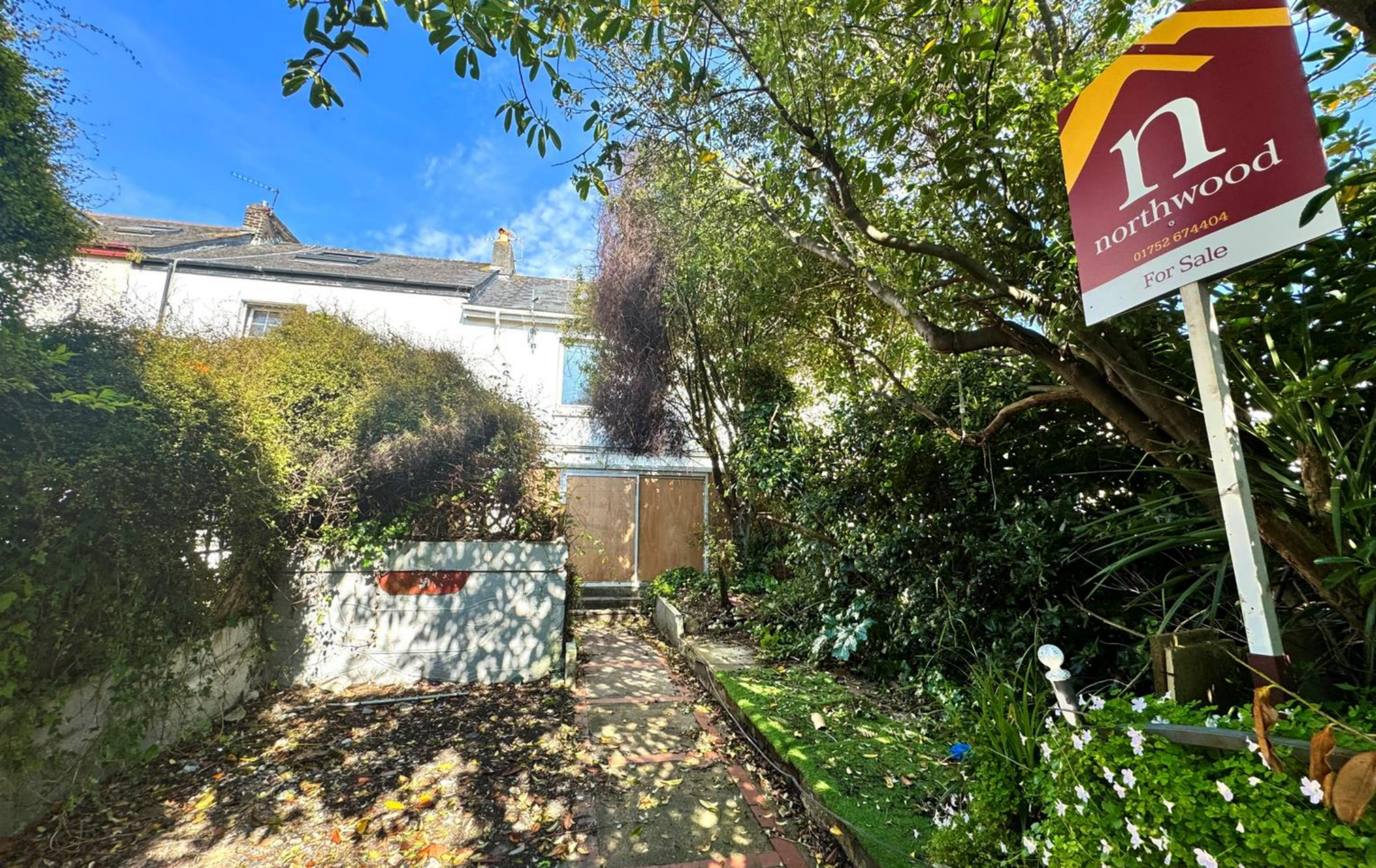
Clarence Place, Plymouth