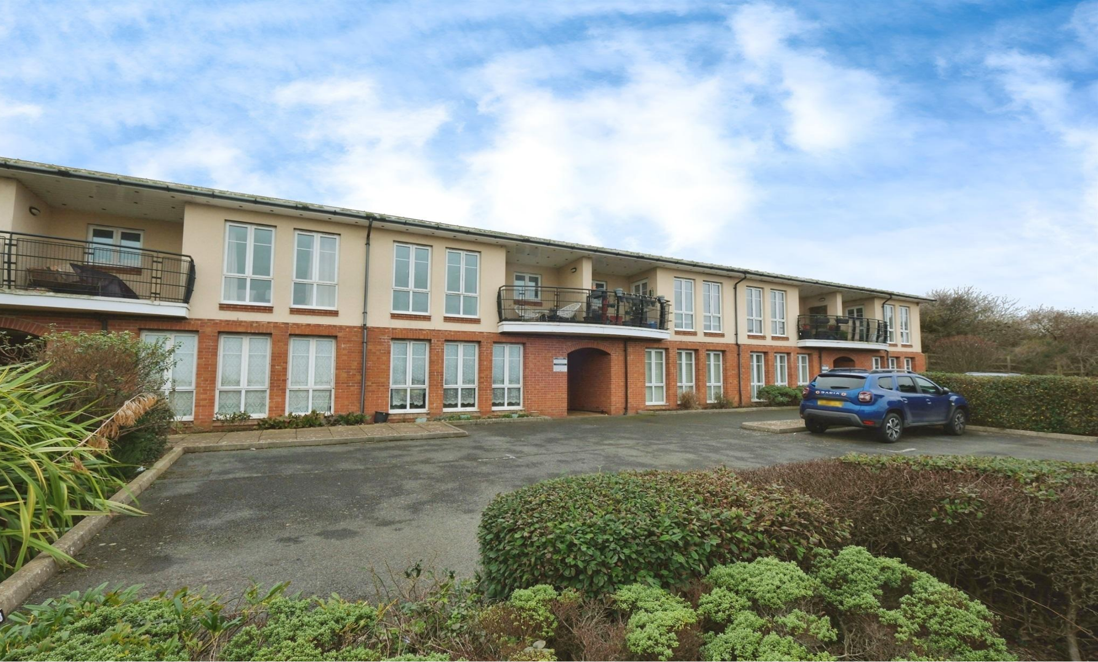
Mariners Wharf, Newhaven BN9 9DU