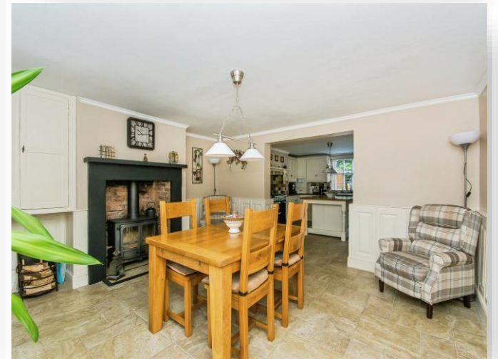
Elm Road, Wisbech PE13 2TB