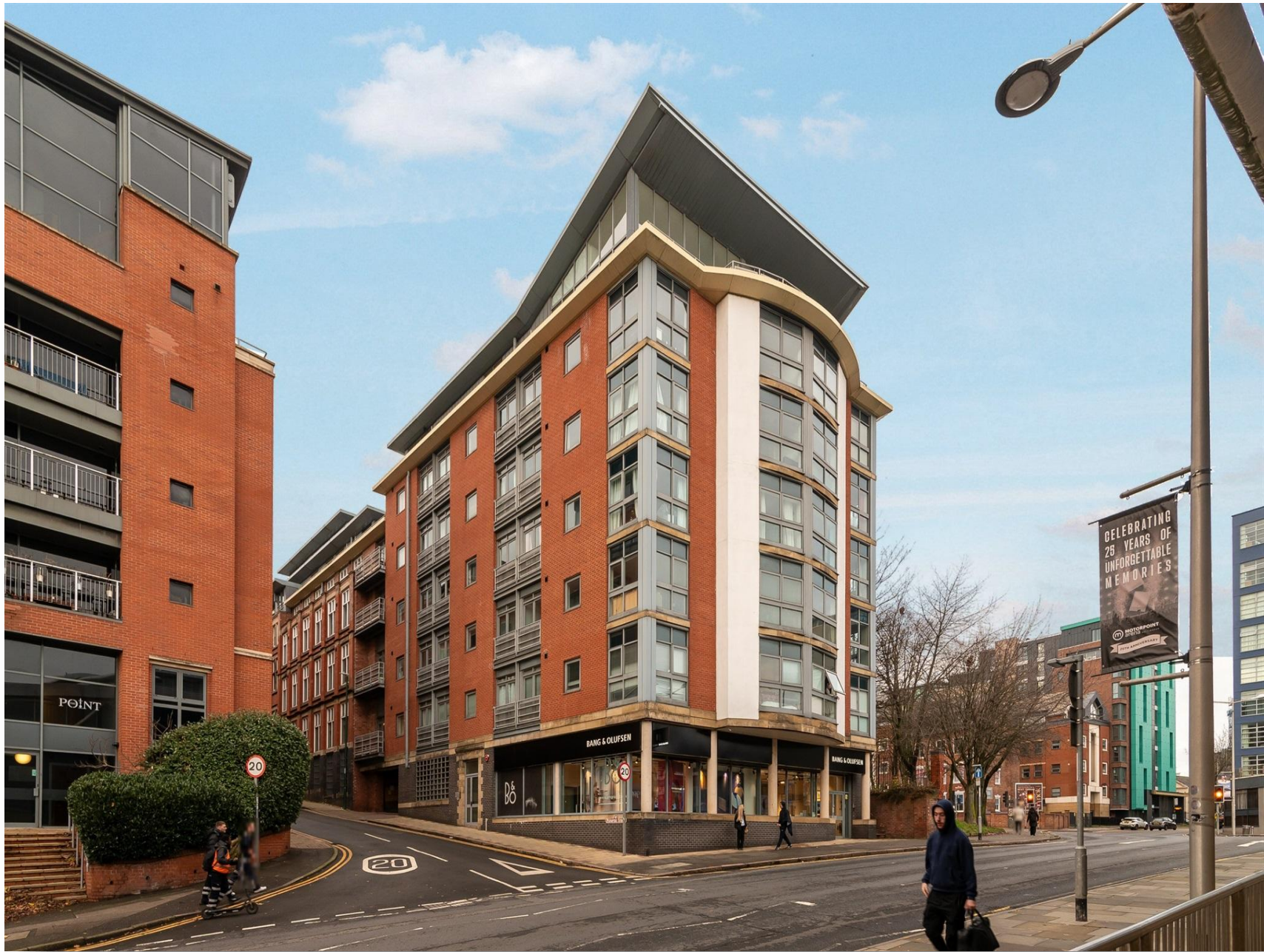
Lexington Place Plumtre Street, Nottingham NG1 1AN