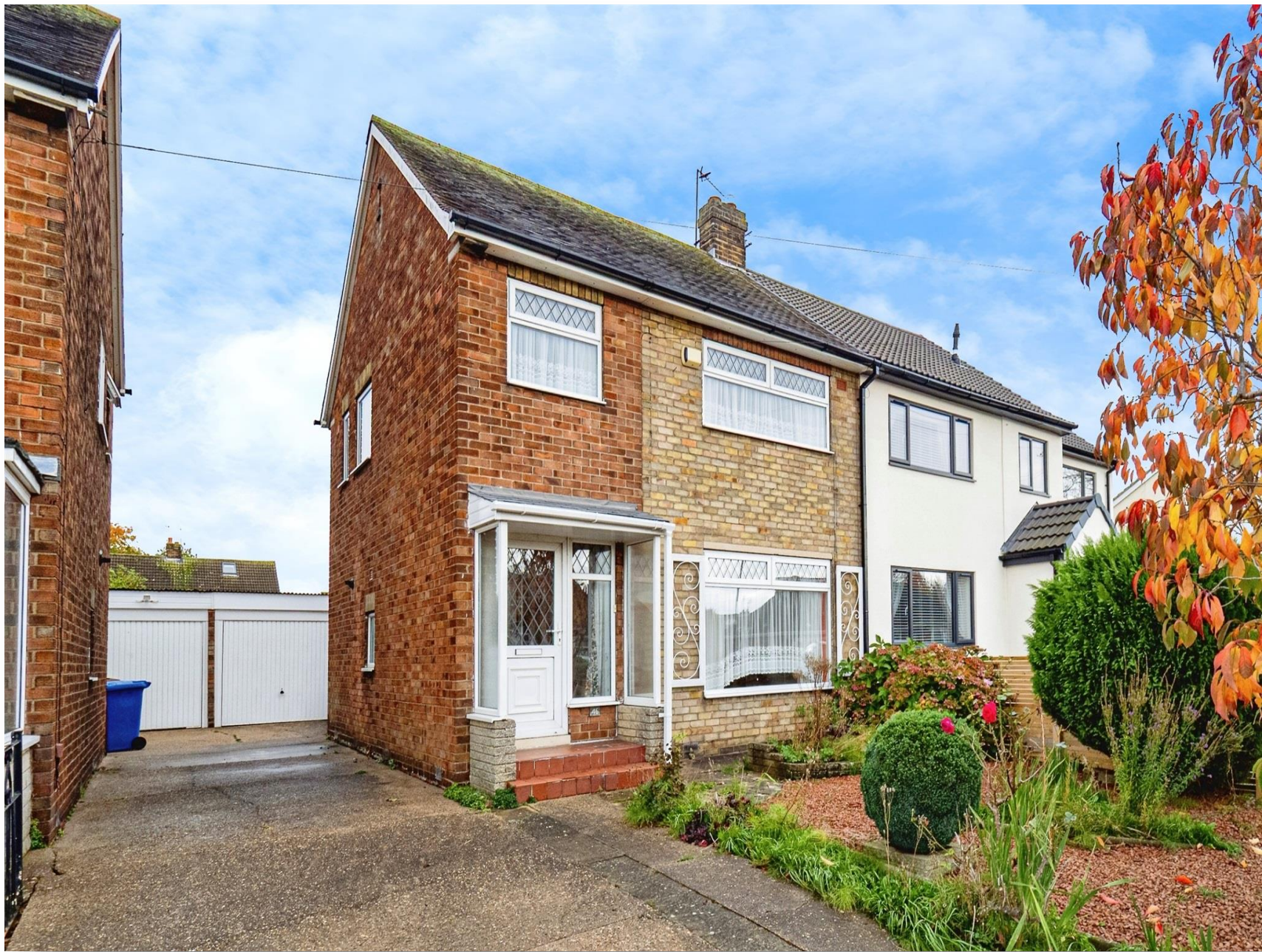
Lime Tree Lane, Bilton, Hull HU11 4EA