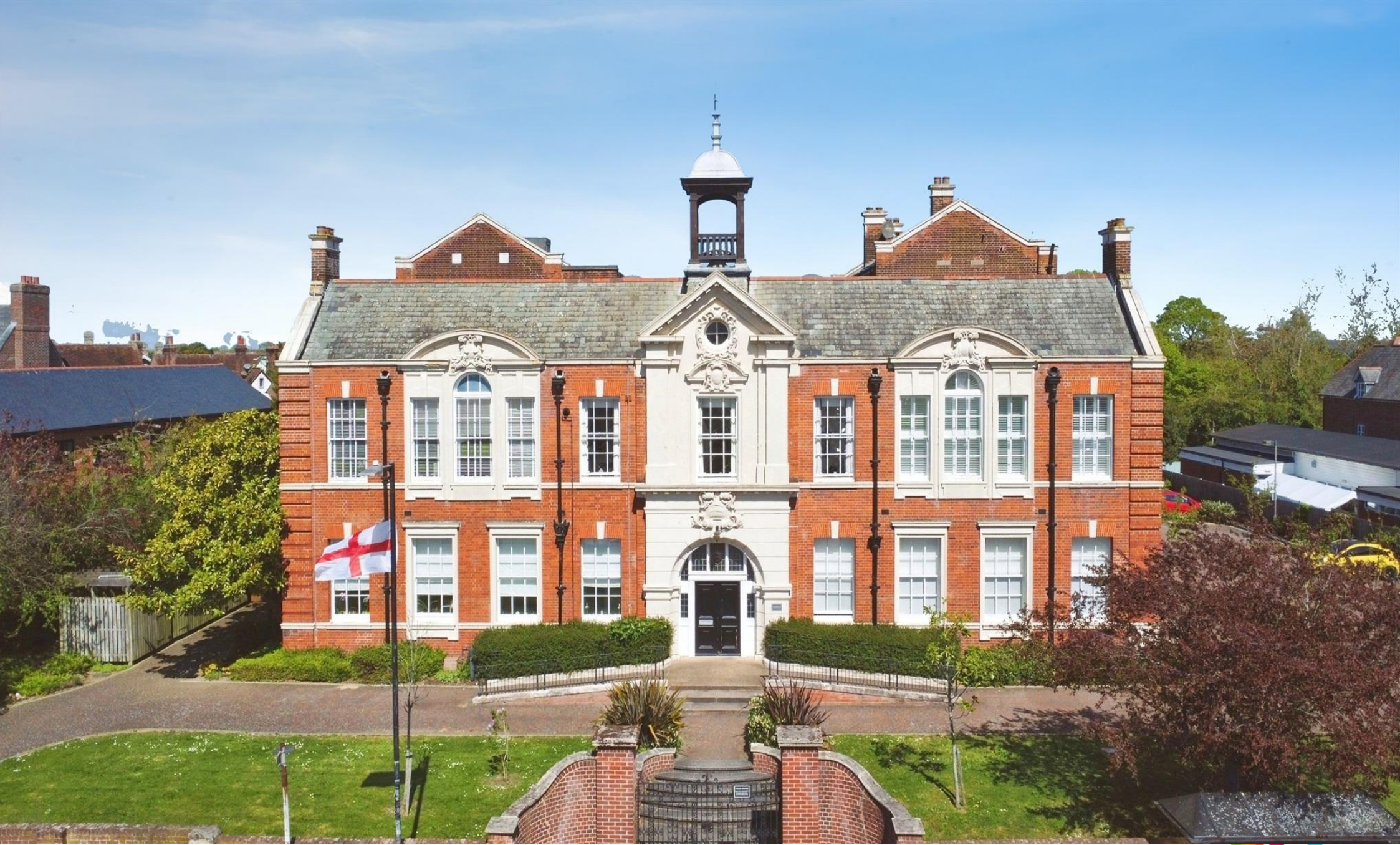
Tabor House, Coggeshall Road, Braintree, CM7 9DB