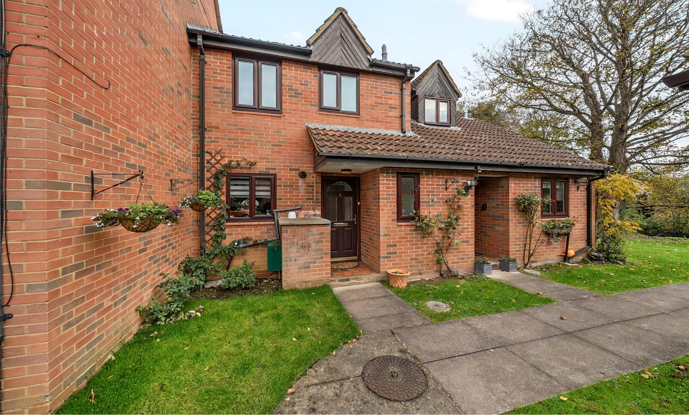
The Beeches, Park Street St. Albans AL2 2NL