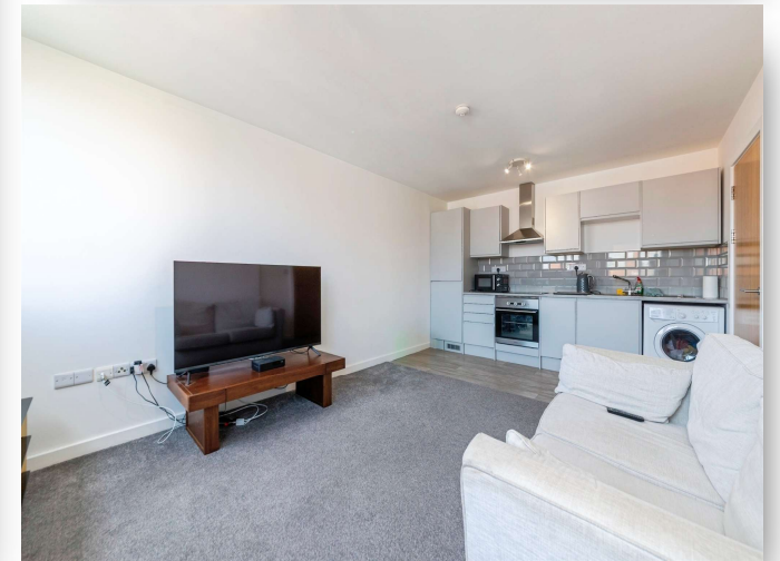
Lombard House Lombard Street, Newark NG24 1XG