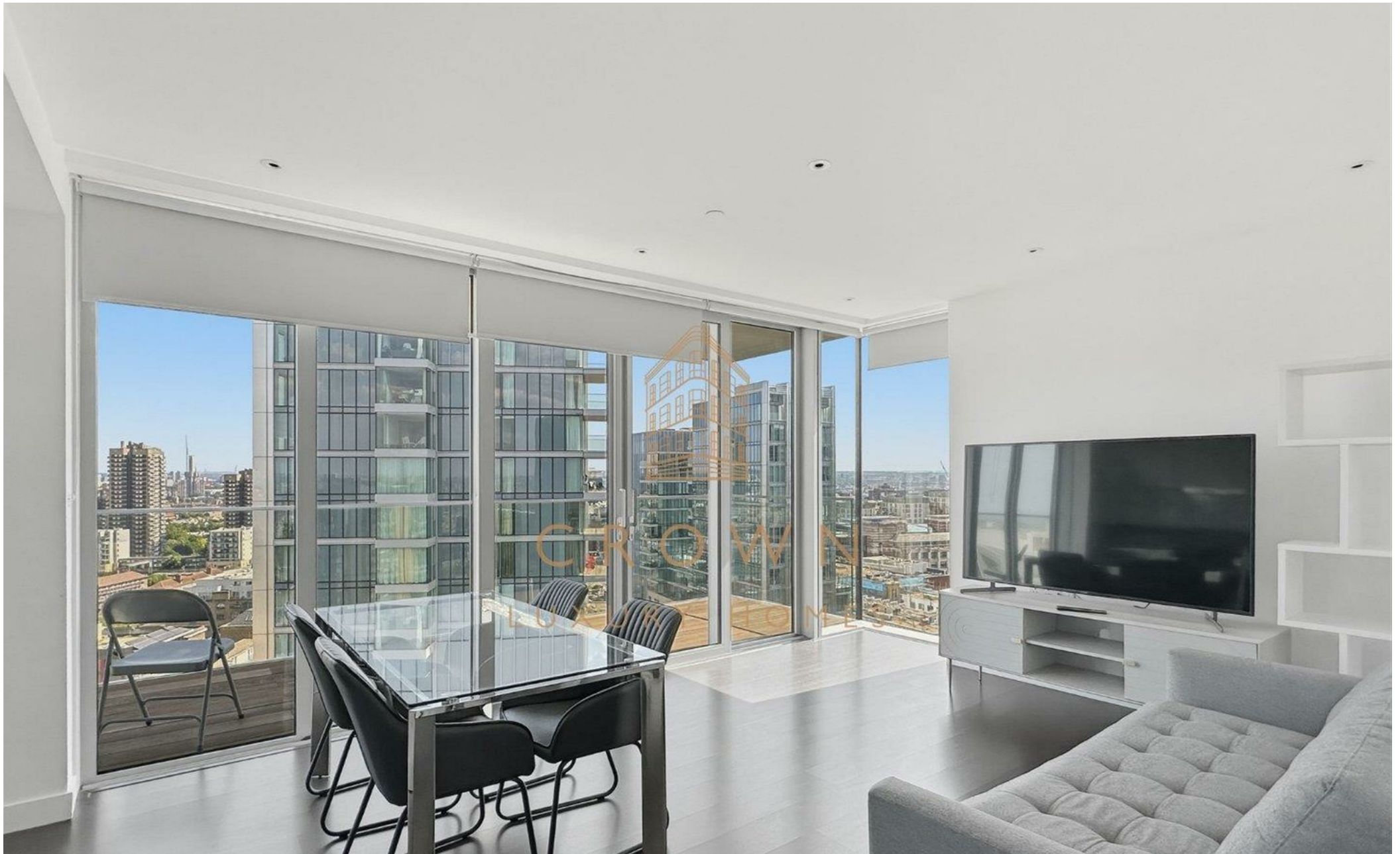
Apartment 1801, 84, Meranti House Alie Street, London, E1 8QD £3,500