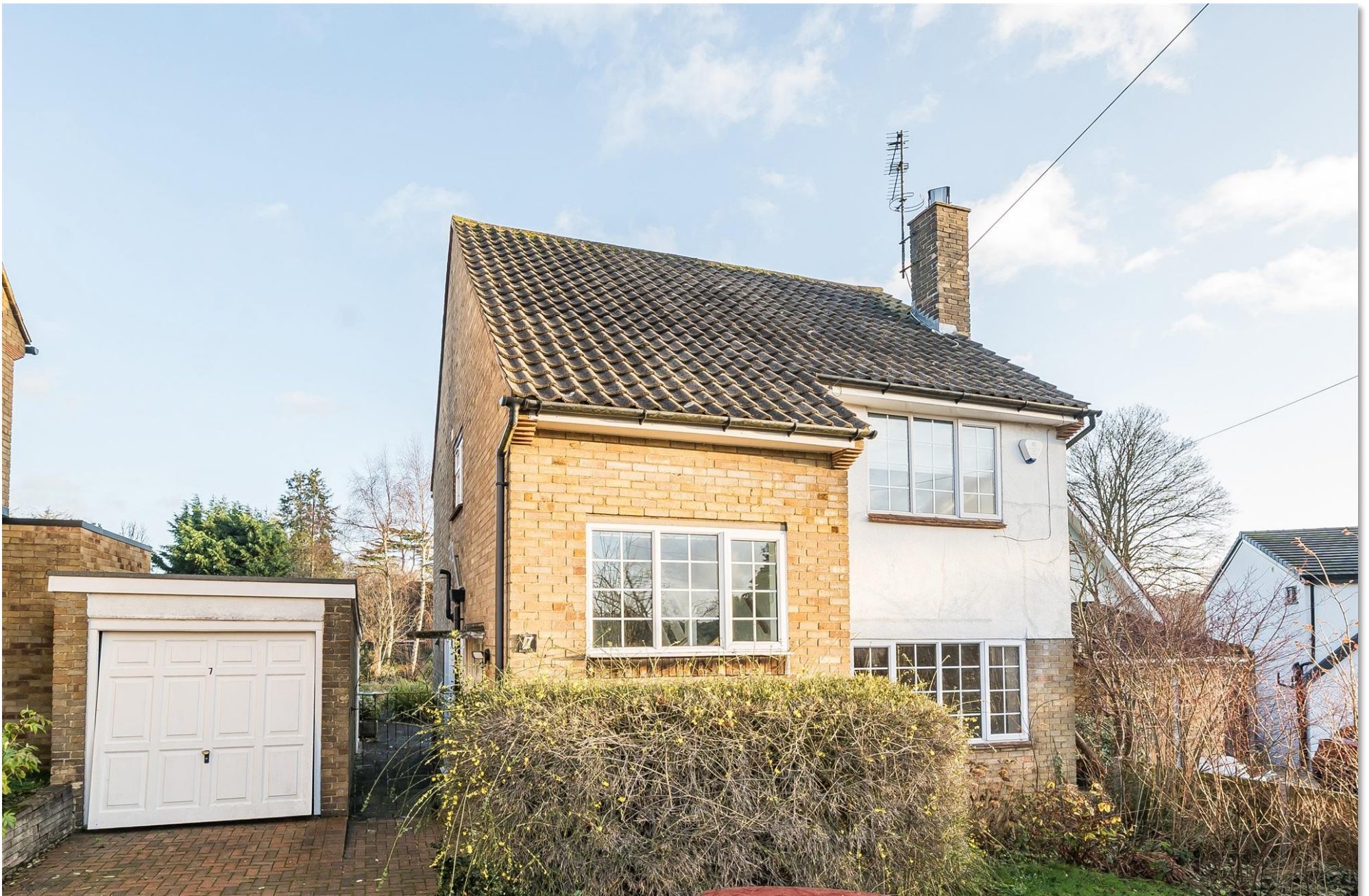
South Park Gardens, Berkhamsted HP4 1JA