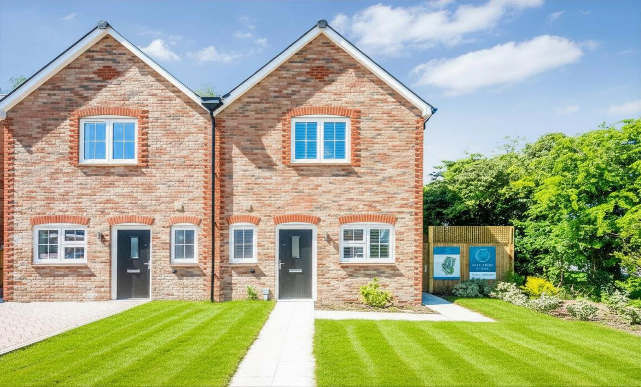
Oak Park Place Goldbridge Road, Newick Lewes BN8 4LD