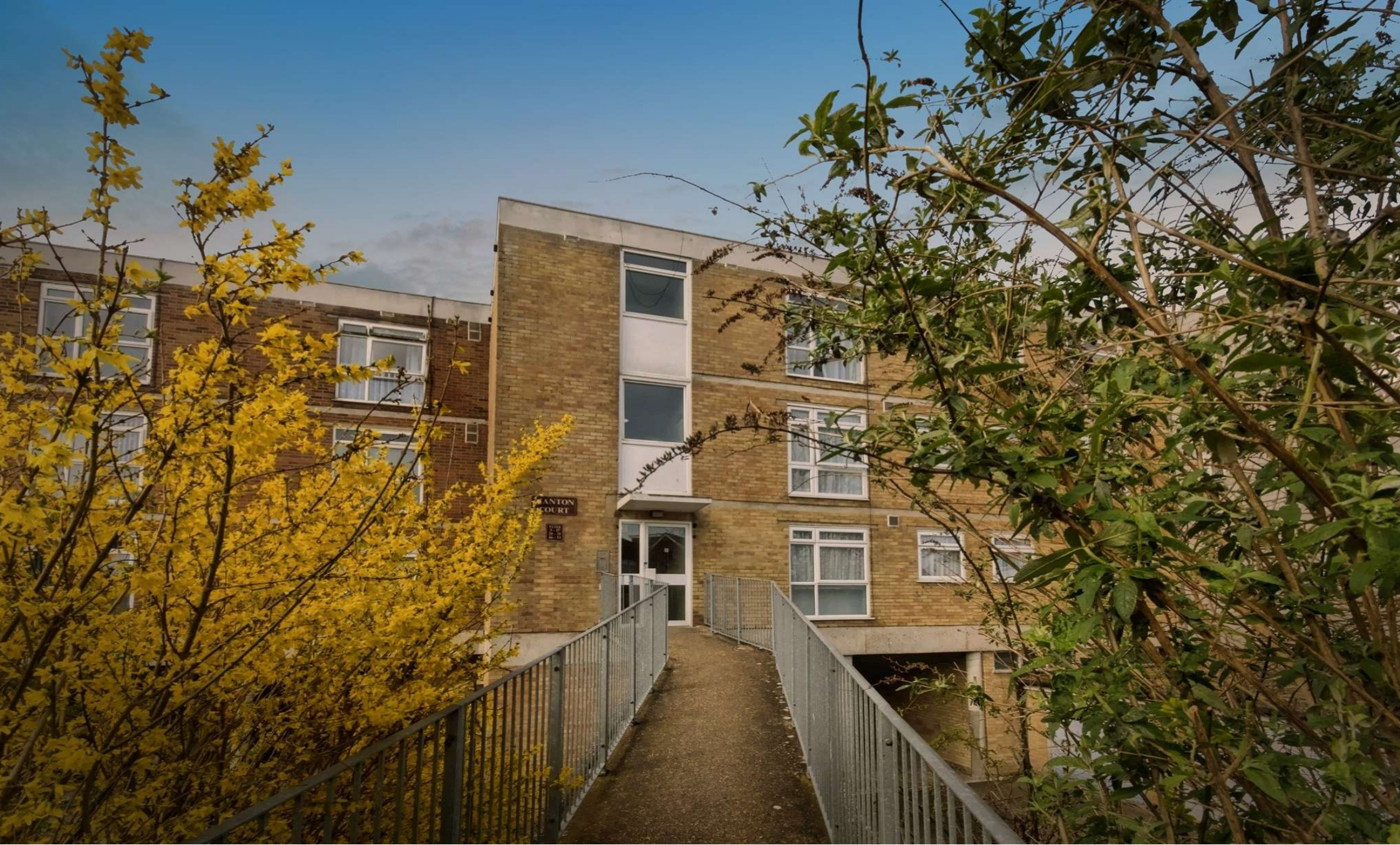
Manton Court Rotunda Road, Eastbourne BN23 6LG