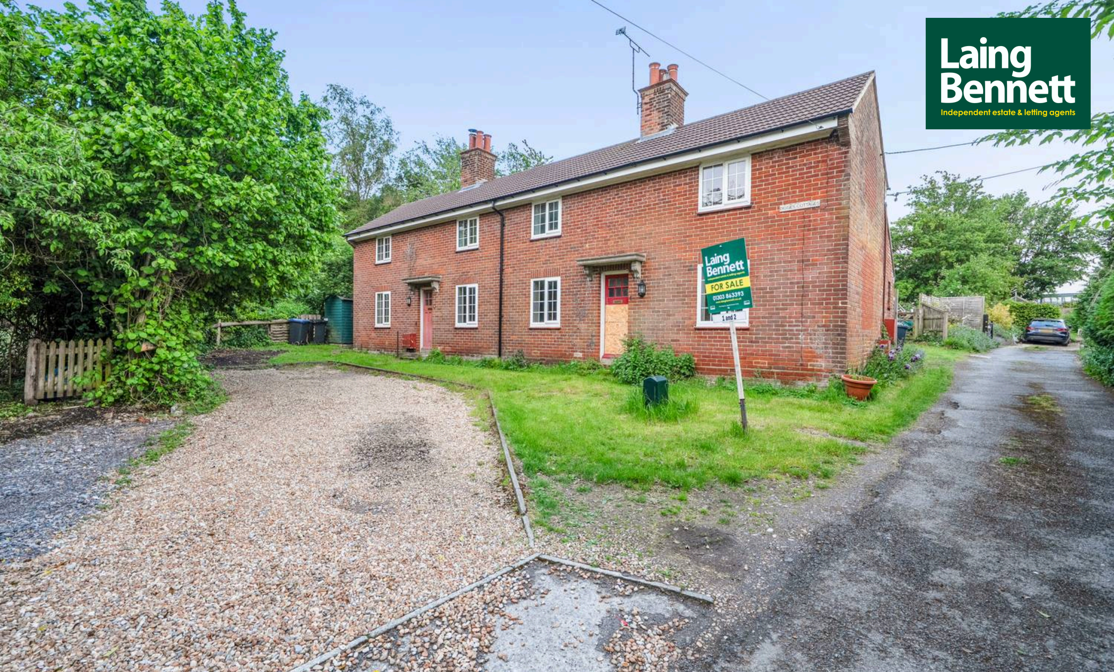
1 & 2 Digges Cottages, Out Elmstead Lane, Barham - CT4 6PH £495,000