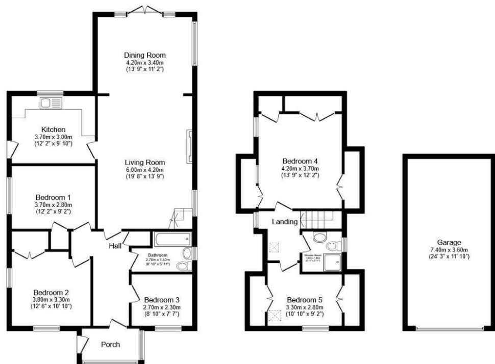
Ground Floor Floor area 100.3 sq.m. (1,079 sq.ft.) First Floor Floor area 37.0 sq.m. (398 sq.ft.) Garage Floor area 27.4 sq.m. (295 sq.ft.)

Total floor area: 164.7 sq.m. (1,773 sq.ft.)