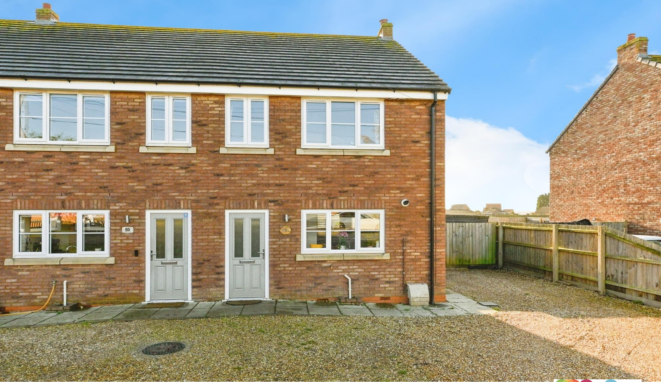
Sutton Road, Walpole Cross Keys, King's Lynn, PE34 4HD