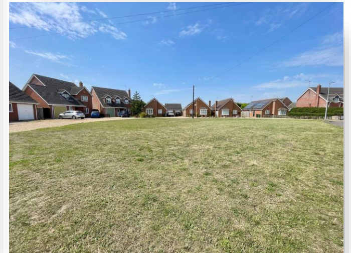
Land At Pippin Gardens, Wisbech, PE13 3XD