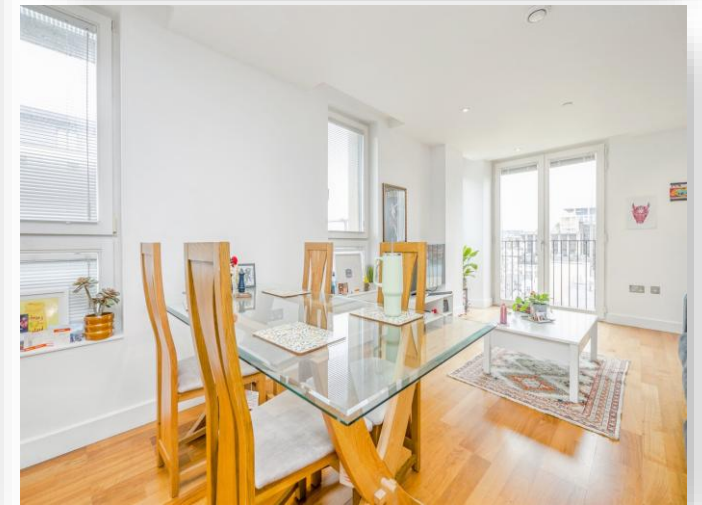
Hayes Apartments The Hayes, Cardiff CF10 1BL