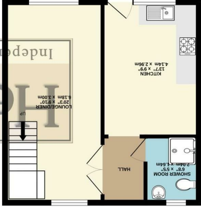
1ST FLOOR 396 sq.ft. (36.8 sq.m.) approx.