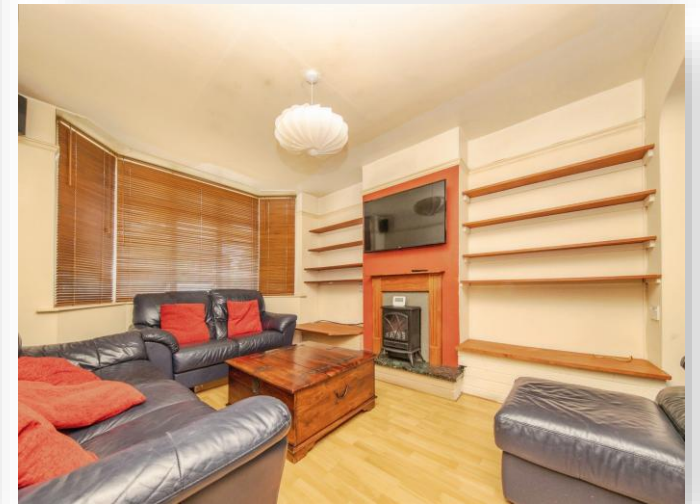
Nacton Road, Ipswich IP3 9NF