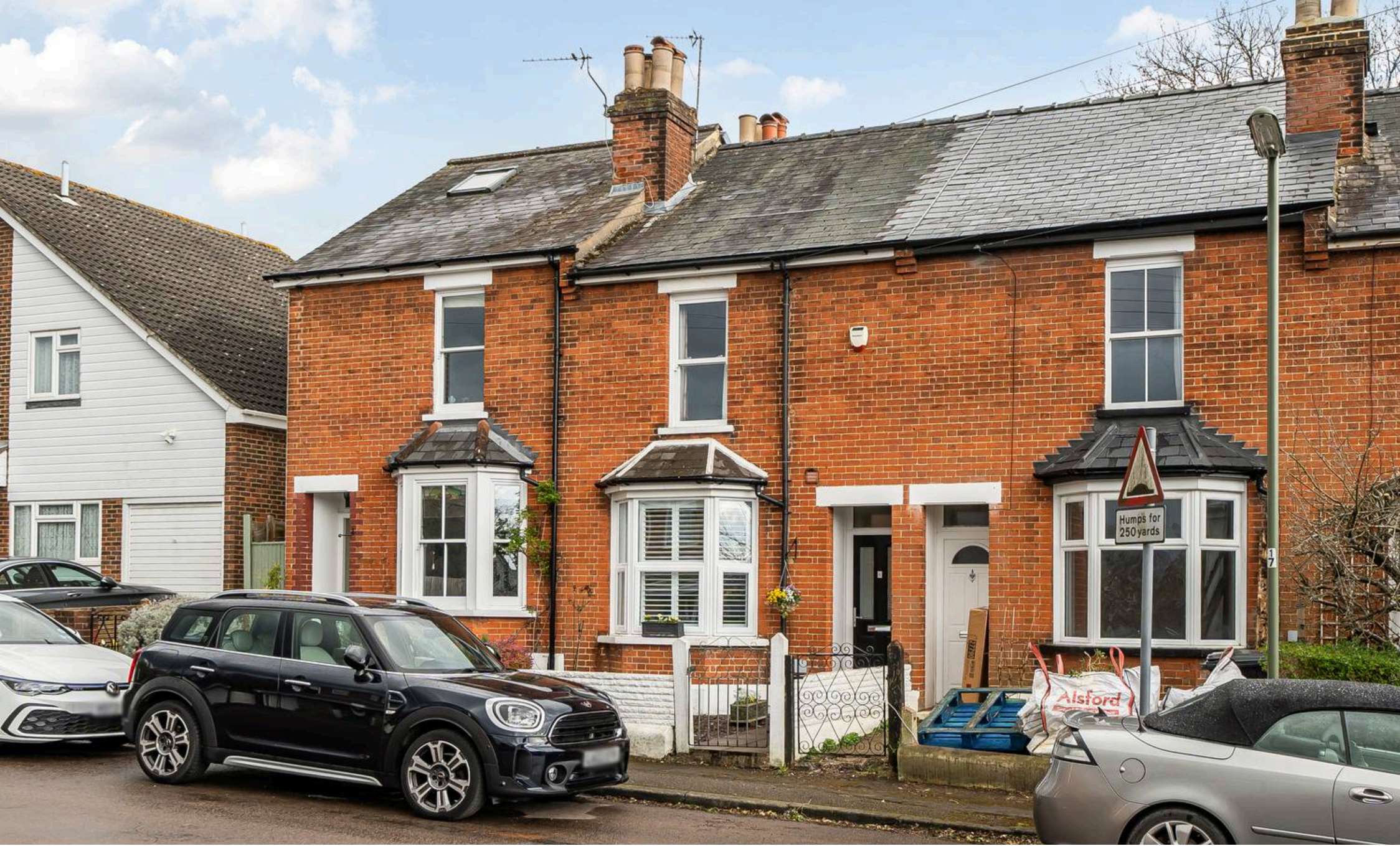
Treadwell Road, Epsom Epsom