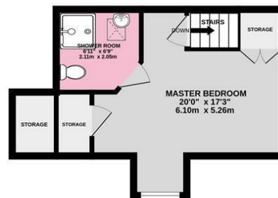
1ST FLOOR 252 sq.ft. (23.4 sq.m.) approx.

and company bacon Estate and letting agents