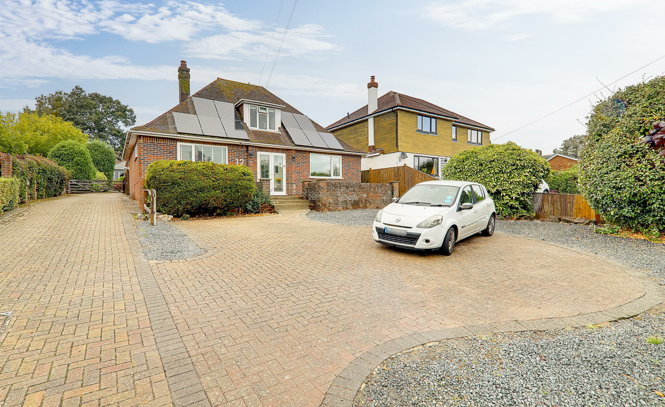
12 Woodland Avenue, Worthing, BN13 3AF Guide Price £670,000